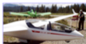
SILVERADO SOARING, INC.